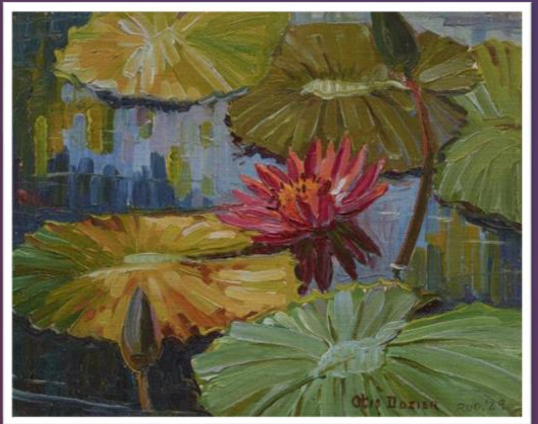
Otis Dozier Waterlilies 1929