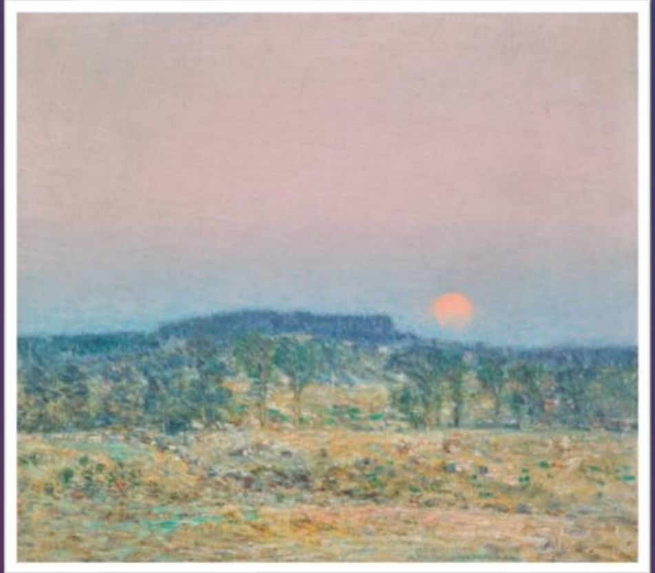
Childe Hassam September Moonrise 1900