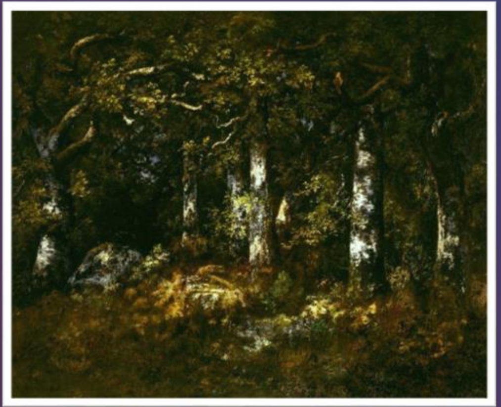
Narcisse Diaz de la Peña Forest of Fontainebleau 1868