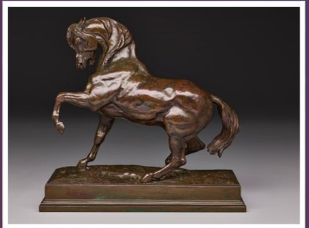
Antoine-Louis Barye Turkish Horse 1818