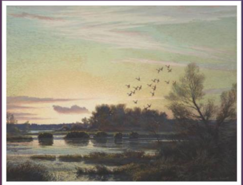
Reveau Bassett Sunset 1897–1981